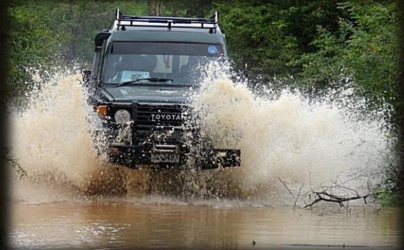
Crossing a flooded water way in National Park

Discover the wonders of the Wilpaththu National Park on another tag-along 4x4 expedition. A unique feature of this itinerary is its self-driving aspect with your own support and guide crew that travels in convoy.