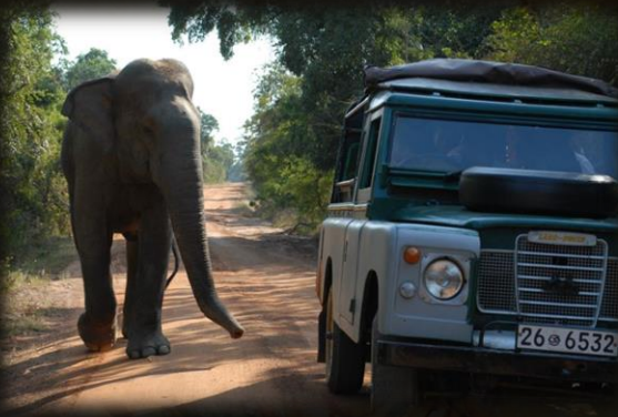
Get close to the locals.... But not too close!

enjoy a 6-hour off-roading experience through the Yala National Park (Block 2) with your self-driving tag along convoy. This is your chance to get up close and personal (but not too close!) to the wildlife that freely roam the National Park.