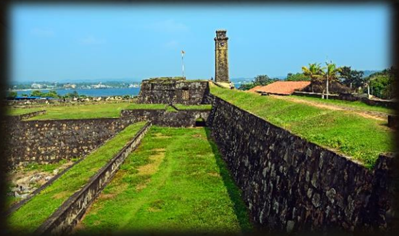
The seaward side of the fort at Galle

Transfer to Beruwala. Take a walk along the Galle Fortress, a UNESCO Heritage listed site. Soak up the charm of this southern Sri Lankan city with a long colonial history and heritage.