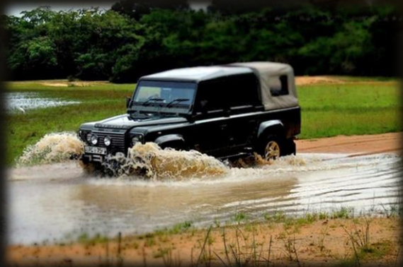
A 4x4 crossing the plains of Minneriya

Following the Sigiriya visit, Engage in another session of tag-along 4x4 driving in the Minneriya National Park. The choice of park will be made on the day depending on the location of the major elephant herds and other wildlife attractions by the experienced guides. It is a great adventure not to be missed.