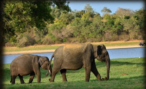
Wild elephants at Minneriya National Park Day 4

Transfer to Sigiriya, where ruins of an ancient Sri Lankan fortress remains atop a massive column of rock nearly 200 m (660 ft) high. Sigiriya is considered to be one of the most important urban planning sites of the first millennium. The plan combined concepts of symmetry and asymmetry to intentionally interlock the man-made geometrical and natural forms of the surroundings.