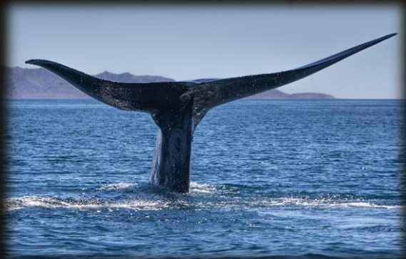
Beruwala is renowned for Blue whale sightings

Spend the morning on a whale watching tour (this tour only operates from November to April).