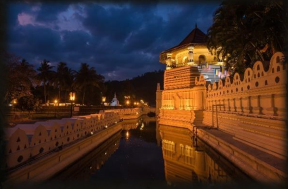
Temple of the Tooth Relic, Kandy

Transfer to Kandy, the hill capital of the country. It is another World Heritage Site and is home to the famous Temple of the Tooth Relic. It was the last stronghold of the Sinhalese Kings during the Portuguese, Dutch and British rule and finally ceded to the British in 1815 after an agreement with the British.