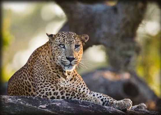
One of the locals at Yala National Park

Transfer to Yala National Park and spend the day at leisure.