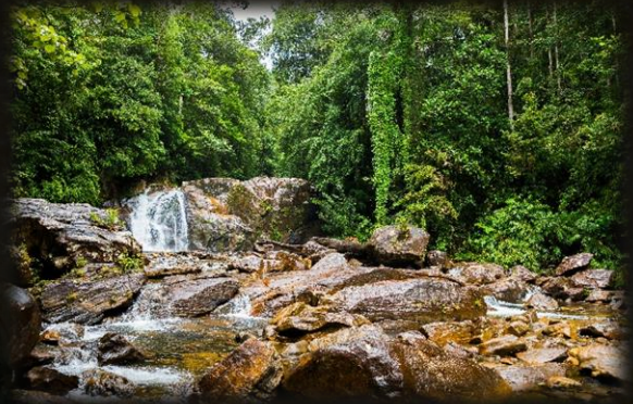
A pristine stream flowing through Sinharaja

Transfer to Kalawana/Sinharaja forest. Stretch your legs on a trekking tour in the Sinharaja rain forest, a UNESCO World Heritage listed site. It is one of the last undisturbed major rainforest areas left in Sri Lanka.