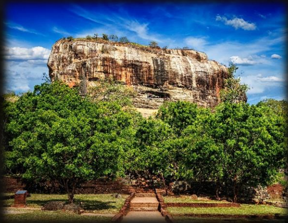
The rock fortress of Sigiriya

Following the Sigiriya visit, Engage in another session of tag-along 4x4 driving in the Minneriya National Park. The choice of park will be made on the day depending on the location of the major elephant herds and other wildlife attractions by the experienced guides. It is a great adventure not to be missed.