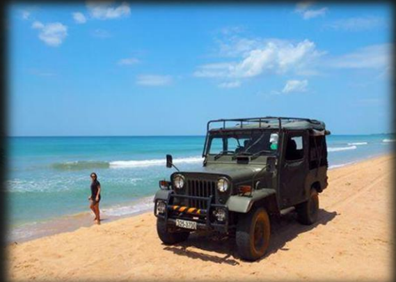
Experience the thrill of driving a 4x4 on the beach

Go on a self-driven (tag-along) 4x4 expedition along the scenic Kalpitiya beach. Experience the thrill of driving off-road with your own support crew to guide and help you (if needed) along the way.