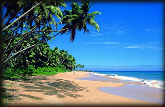
The tropical landscape; Beruwala beach.

Visit the beautiful Beruwala beach. Spend the day at leisure.