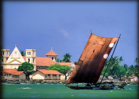
A traditional fishing boat on the water of Chilaw

Transfer from the airport to Chilaw, a coastal fishing village and spend the remainder of the day at leisure.