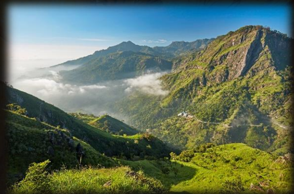
A landscape view of scenic Ella

Transfer to Ella, hill-country village where you will find some of the most stunning scenery on this tropical island paradise. The beautiful landscape is a fusion of tea plantations, mountain peaks, hillside train tracks, lush jungle and flowing waterfalls.