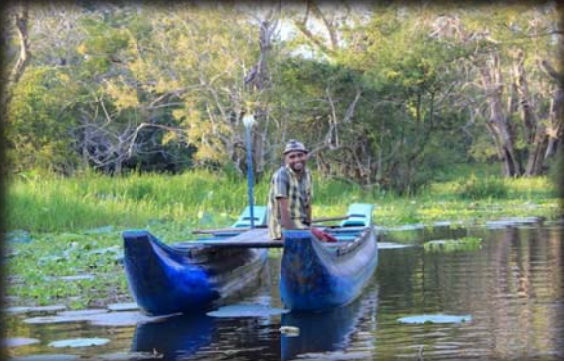
Ride on a traditional catamaran at Hiriwadunna village

Experience the authentic Sri Lankan village life at Hiriwadunna village.