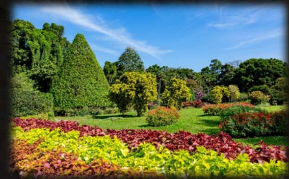
Royal Botanical Gardens at Peradeniya, Kandy

Visit the Royal Botanical Gardens in Kandy.