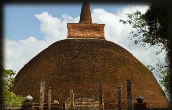
An ancient stupa at Anuradhapura

Visit the ancient capital of Anuradhapura. It is famous for its well-preserved ruins of an ancient Sri Lankan civilisation. Established around the 4th century BC, it is one of the oldest, continuously inhabited cities in the world. The ruins principally consist of monastic buildings, dagobas and pokunas. Remains of monastic buildings are scattered throughout the region as raised stone platforms, foundations and stone pillars.