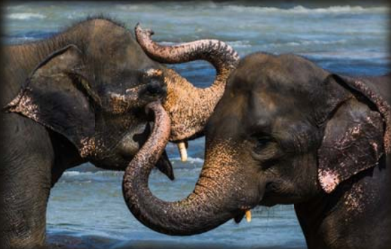
Elephants bathing at the Pinnawala sanctuary

Visit the elephant orphanage and sanctuary at Pinnawala, where you can get up-close and personal with the elephants.