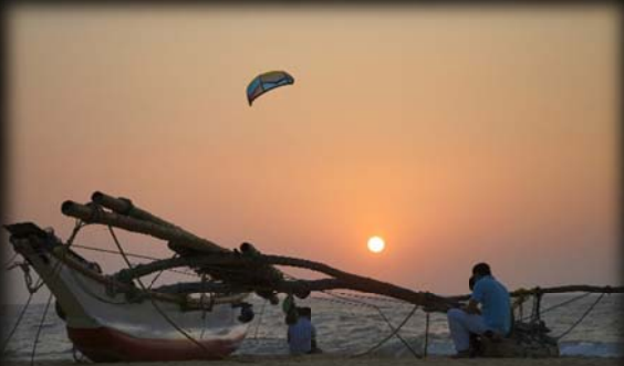
A traditional fishing boat on the beach at Negombo

Arrive in Negombo, a coastal fishing village and spend the remainder of the day at leisure.