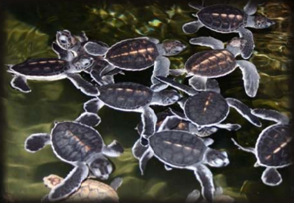
Hatchling turtles at Kosgoda

Visit the Turtle Hatchery at Kosgoda. Operated by the Wild Life Protection Society of Sri Lanka this hatchery was established in 1981 to protect Sri Lanka's turtles from extinction.