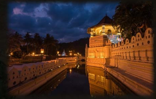
Temple of the Tooth Relic, Kandy

Kandy, the hill capital of the country, is another World Heritage listed site and is home to the famous Buddhist Temple of the Tooth Relic. It was the last stronghold of the Sinhalese Kings during the Portuguese, Dutch and British rule and finally ceded to the British in 1815.