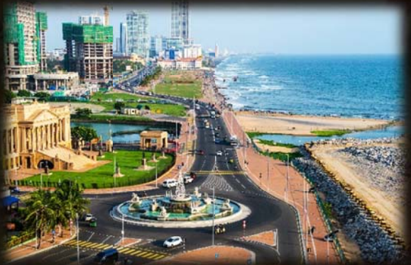
Skyline of Colombo

Return to Colombo and spend 2 days sightseeing, shopping and relaxing in Colombo.