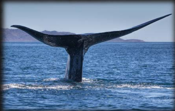
Whale watching off the waters of Mirissa

Relax on a whale and dolphin watching tour at Mirissa in Bentota. The giant blue whales, sperm whales, Bryde's whales and even the occasional killer whale are common in these waters, predominantly between November and April. Dolphins in these waters include bottlenose dolphins, striped dolphins and spinner dolphins.