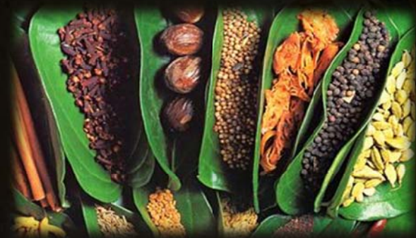
An assortment of spices

On the way to Kandy, visit some of the many Spice Gardens in Matale and Mawanella where cinnamon, cardamom, pepper creepers and several other spice trees, plants and creepers are found.