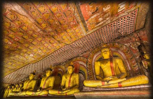
Buddha statues inside the Dambulla Rock Temple