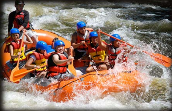
Thrills of White Water Rafting

Transfer to Bentota and engage in White Water Rafting on a 5 km stretch of the picturesque Kelani River encountering 5 major rapids and 4 minor ones at Kitulgala.